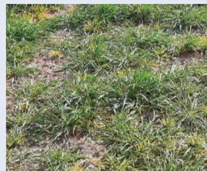
Damage from leafhoppers, just "individual plants" affected.

A regular threat on the continent now confirmed in the UK from samples submitted retrospectively. Although samples were specifically from the Eastern Region, it would be naive to think it has not been present elsewhere in country.