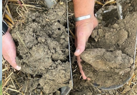
Cultivated (R) vs uncultivated soil (L)

The soils' bulk density and texture provide an insight to structure and associated features including water infiltration, available water capacity, soil porosity and rooting ability. An ideal bulk density is around 1.1-1.2, meaning there is space between soil particles for air and water flow and root growth.